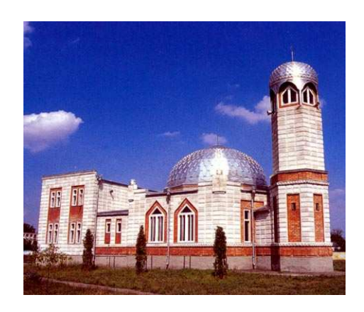
Post-Soviet mosque in Adigea. The Adigeans are the only Muslim nationality in the republic, the rest being Orthodox Christians in the majority.