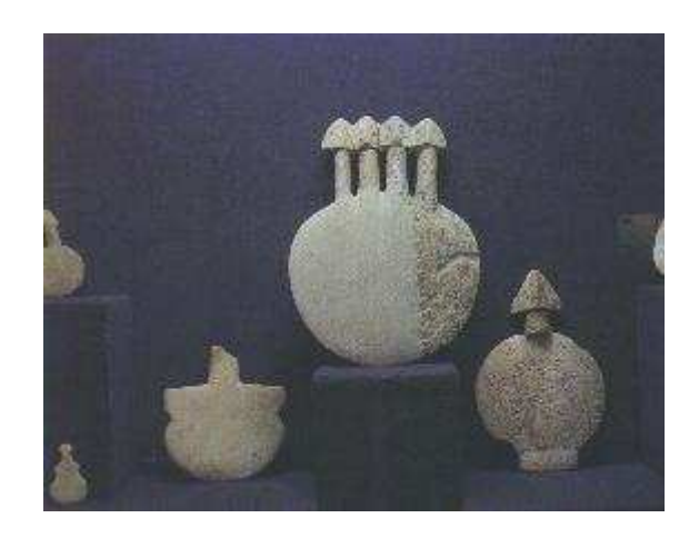
Hattian idols in Museum of Anatolian Civilizations. These stone statues survived the vicissitudes of nature for millennia, whereas the wooden Circassian godly representations soon found perdition.

The Hattians believed in a number of gods representing various acts of nature in the form of animals. Major deities included Storm-god, Patrongod, and Warrior-god. Statues of their most popular idols are on show in some major museums of Turkey.