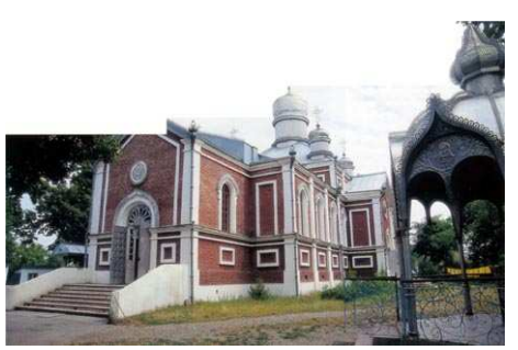
Church in Adigea. Thus far, religious conflict has escaped all Northwest Caucasian republics.

in Russia fell in all areas except in Kabardino-Balkaria, where the number rose by 1,700.