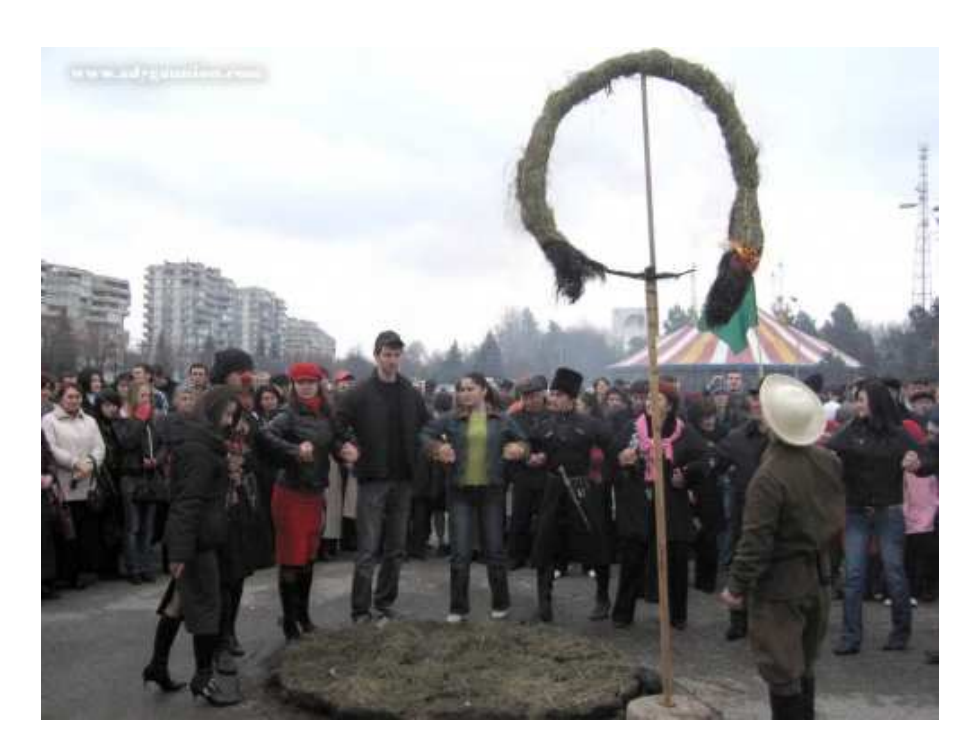
Modern-day Circassians dancing round a Fire/Cross in celebration of the Circassian New Year, 22 March 2007 in Nalchik. The round turf represents God's Field (Тхьэм и губгъуэ). The animist-cum-Christian rite is a phenomenon of the eclectic nature of the Circassian system of beliefs. The kindred Abkhazians are more avowedly animist-pagan, despite the fact that the majority are formally Christian, still clinging tenaciously to their old traditions and rituals.