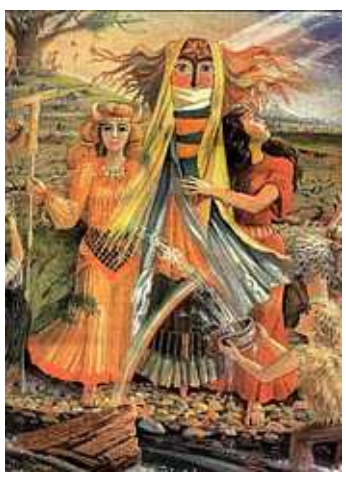
Depiction of the ritual of supplication for rain. The effigy of Hentsiygwasche, the Goddess of Rain, is carried across the village and doused with water.

a suitor, with a group of trusted friends, abducted his beloved (with her own assent) from her parent's house on a set date and time. <sup>16</sup>