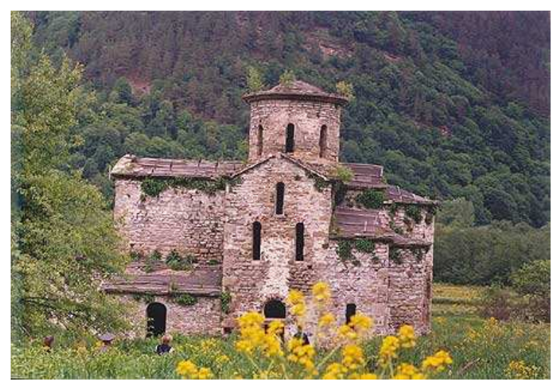
Zhulat, or Tatartup, the sanctum sanctorum of the (Eastern) Circassians (Жулат [Тэтэртуп], адыгэ тхьэхэм я зэхуэсыпІэ.). Perhaps the essence of Circassianness resides in the ancient edifices of native culture and beliefs, unadulterated by extraneous effects engendered by the vicissitudes of time.

Like their Greek counterparts who had their abode in Mount Olympus, the Adiga gods and goddesses met for deliberations and held festivals on top of the sacred mountain, Tatartup. According to popular belief, this was located at the confluence of the Balhq (Malka) and Sherej (Cherek) Rivers (in the northeast of the Kabardino-Balkarian Republic). Its ancient name was Zhulat (Жулат; from Joritla Ant, Temple of the Ants, presumed ancestors of the Circassians— Shora Nogmov, 1861), but this changed (to Tatartup [Тэтэртүп] = Tatar Hillock) when the Tatars temporarily occupied the environs in one of their forays into Circassia. It used to have temples for worship and supplication, and at which sacrifices were offered to the gods.