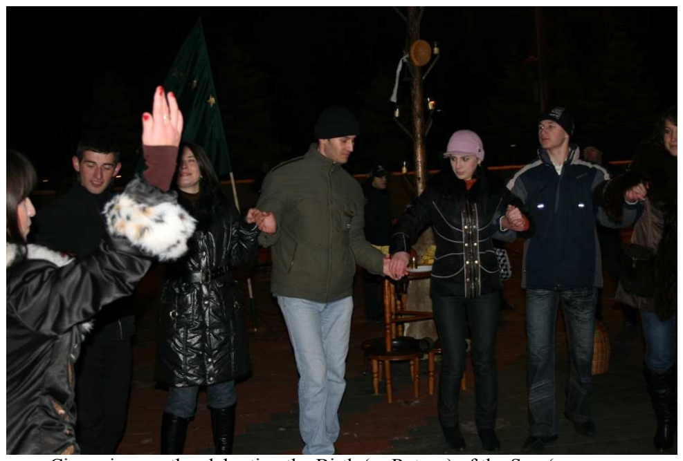
Circassian youth celebrating the Birth (or Return) of the Sun (дыгъэгъазэ; Digheghaze ) on 22 December 2007 in Nalchik. This is the time when the sun reaches its lowest apparent point in the sky and starts to rise up, a propitious occasion for an agrarian-pastoral society. This is one of a number of prehistoric festivals that have been resurrected in the new millennium. The pole in the background is the principal emblem of this celebration. The round loaf of bread high on the pole is an ancient folkloric depiction of the sun-god.

In the (pre-Christian) X'wrome festival, the elders went round the village pronouncing their toasts and the young ones went in a group, called 'X'wromashe' («хъуромашэ»), collecting victuals and singing 'X'wrome', basically a toast wishing for plentiful crops, good health, prosperity and success. All households donated generously, for it was thought that otherwise the coming year would prove bad to the stingy household. After finishing their round, the groups gravitated towards a designated homestead, where the foodstuffs were cooked and prepared for the feast.