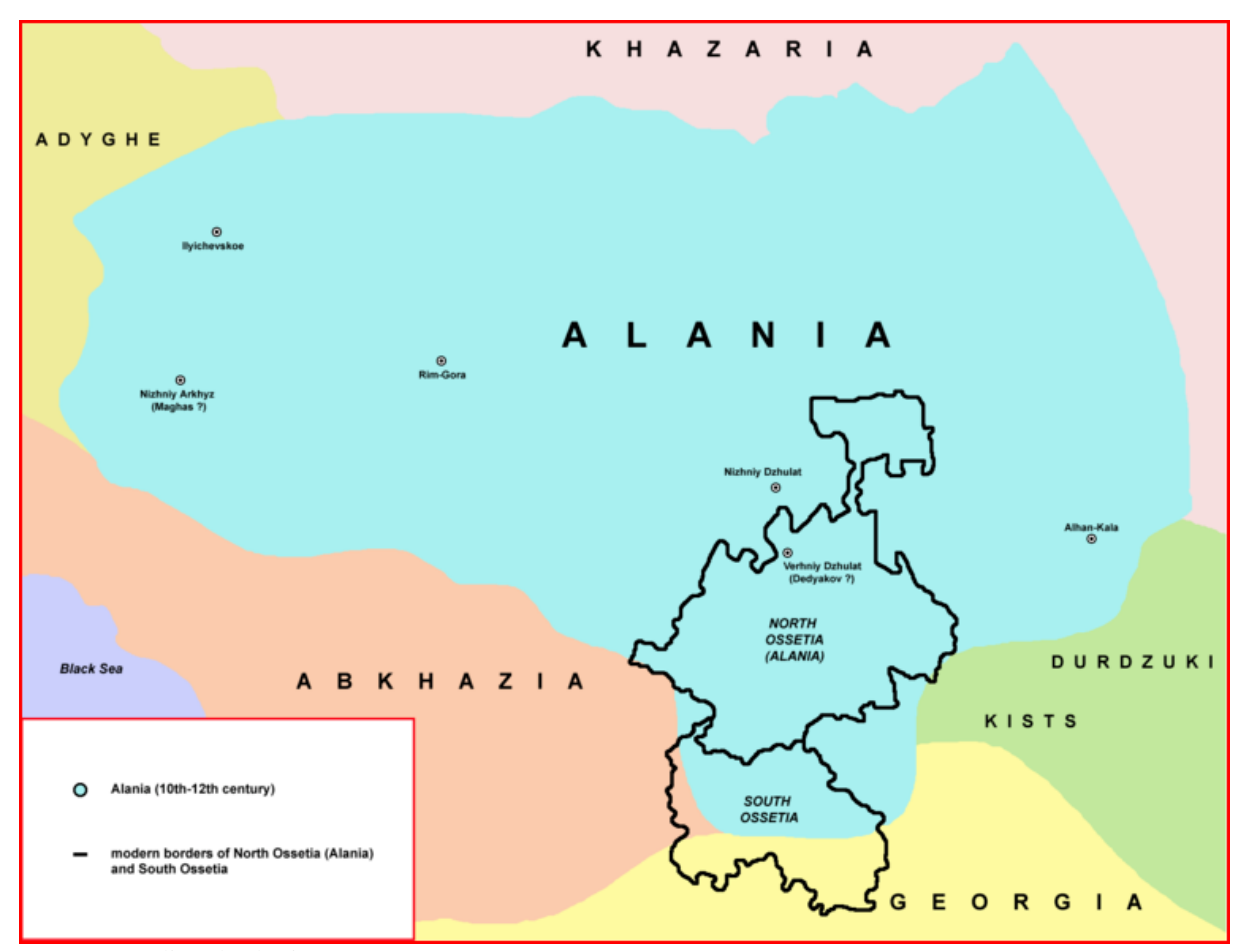
Map 2: Medieval Alania

There are many lexical borrowing from Circassian into Ossetic and vice versa. It is often impossible to ascertain who borrowed what from whom, and many such words have parallels in other Caucasian languages (Klimov 1986: 194). Kambolov (2006: 260ff.) claims there are around 750 Alanian-NW Caucasian lexical isoglosses, 480 of which are shared with Kabardian, and only 140 with Abkhaz. Here are some examples of probable Ossetic loans in Kabardian: